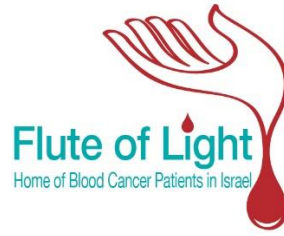
Giora Sharf, Director Flute of Light - Home of blood cancer patients in Israel (Israel)