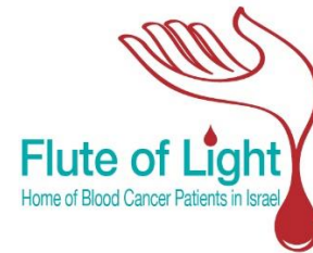
Giora Sharf, Director Flute of Light - Home of blood cancer patients in Israel (Israel)